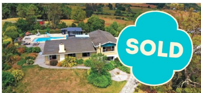
134 Tarrant Rd, Upper Moutere

Unbeatable Flat Fee More money in your pocket