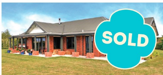
99 Dawson Road, Upper Moutere