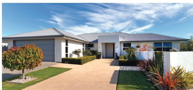
39 Sanderlane Drive, Motueka $659,000+